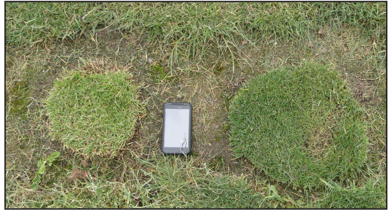
Growth pattern differences between LS Perennial Ryegrass on the right and the other "re-generating" ryegrass on the left after 6 months.