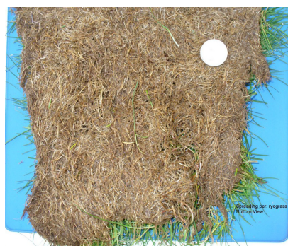
The photo to the right shows the dense root mass of LS Perennial Ryegrass.

There are a few companies that do not use the NTEP and simply rely on their own research to validate their breeding programs. Unfortunately these in-house trials are anything but independent. In addition most grass seed companies only test their cultivars in a few locations due to cost, the NTEP tests nationally. Make sure you ask for NTEP data – the only truly independent turfgrass trial in the country.