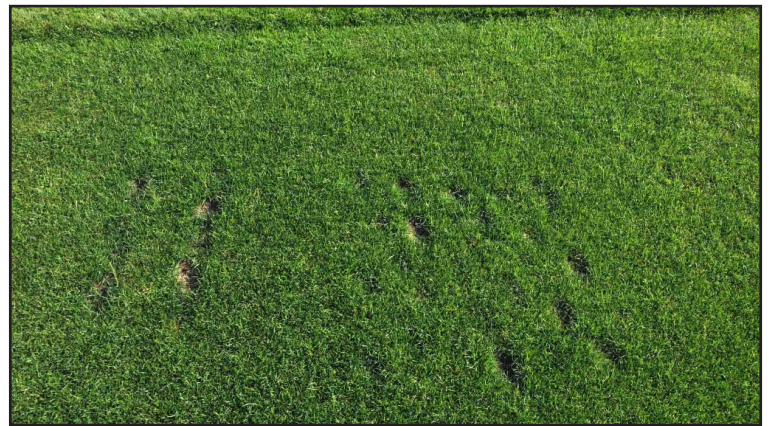
The photos above show the regrowth potential of LS Perennial Ryegrass. The divots were taken 7-14-11 and regrowth has almost completely filled in by 8-21-11.